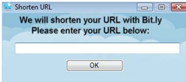
Shorten URL PopUp

When you copy and paste a link (link must always start with http:// ) or type "http" Feed My Twitter will automatically recognize it as a link and will pop up a Shorten URL box. Simply type your link in the box and press the OK button. Feed My Twitter will automatically shorten your link with Bit.ly and add it in your Twitter message. Because most links are very long and Twitter only allows 140 characters in